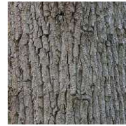
Tulip Tree (×2)