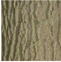
Tree of Heaven (×2)